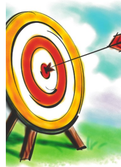
Stay on Target